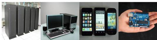
(a) Cluster (b) Personal Computer (c) Mobile Device (d) Microcontroller