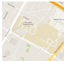
(b) A map