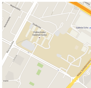
(b) A map